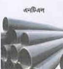
এনটিএল এক্সাইট, গিয়ার এক্সএল পাইপ