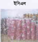
ইসিএল বৈদ্যুতিক তার