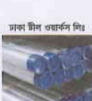
চাকার ঝিল ওয়ার্কস লিঃ এস এস রড ও বার সামগ্রী