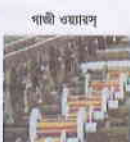
পাথী ওয়াটার তামার তার (এসইসি, এসি, এইচ ডিবিবি)