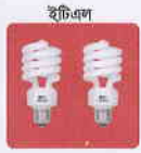
ইটিএল সিএফএল, এলইডি ও টিউব লাইট

The Commercial Attaché Embassy of Turkey Road No.2, House No.7 Baridhara 1212. Dhaka Bangladesh.