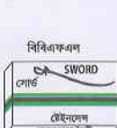
বিবিএফএল শেভিং ব্লেড মেসার