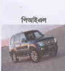
পিআইএল জীপ, বাস, ট্রাক